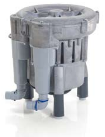
V 250 S suction machine

Calls for machines that are maintenance-free with almost silent running qualities. The V 250 S meets such requirements: the non-contact rotating blades of the turbines create the required vacuum and volume flow within seconds. The impeller is made of special corrosion-resistant composite which makes it more resilient to humidity and moisture. A reliable electric motor ensures non-stop operation. And the integrated condensate separator gives a high measure of protection against the ingress of condensate water.