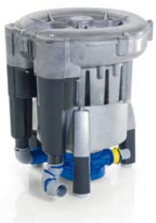
VS 250 S combined suction unit